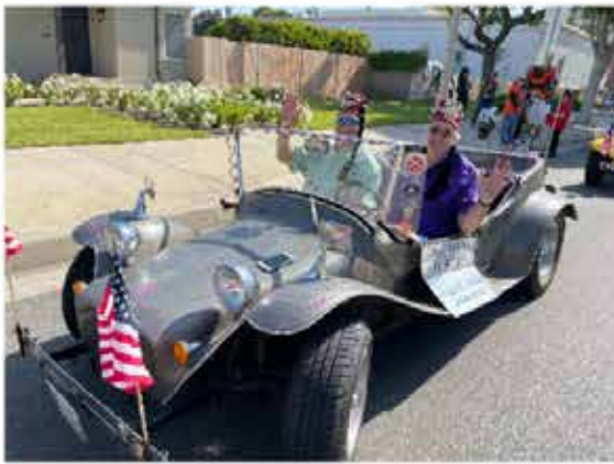
Gray 1959 Volkswagen Beautiful purple Shrine detailing $3,800