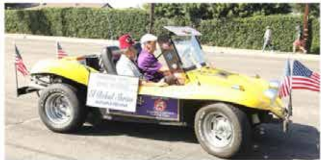
Yellow 1961 Volkswagen $5,000