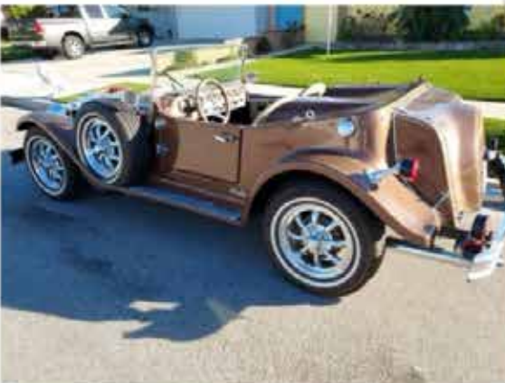
Brown 1979 Mini Mark Newer 1600 CC engine $5,000